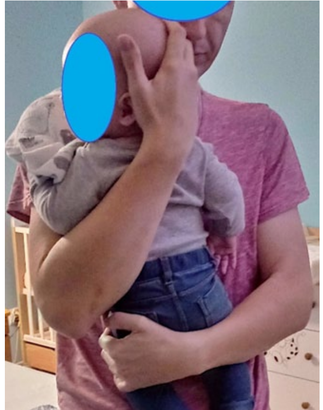
Figure 3. Carrying the child facing the world with hip extension (own sources).