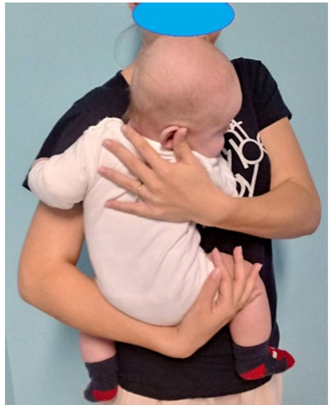
Figure 6. The so-called ‘carrying on the hip’.

At the early stage of a child’s development the spine is not prepared to adopt axial loads. Therefore, first of all, car-