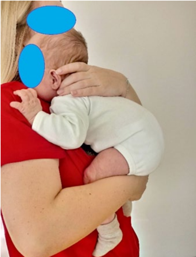
Figure 2. Kyphotization of the lumbar spine in an improperly carried infant.