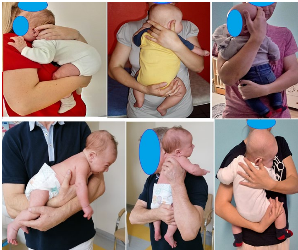
Figure 1. Examples of an infant's position when being carried.

The most frequently observed mistakes when carrying a baby include: