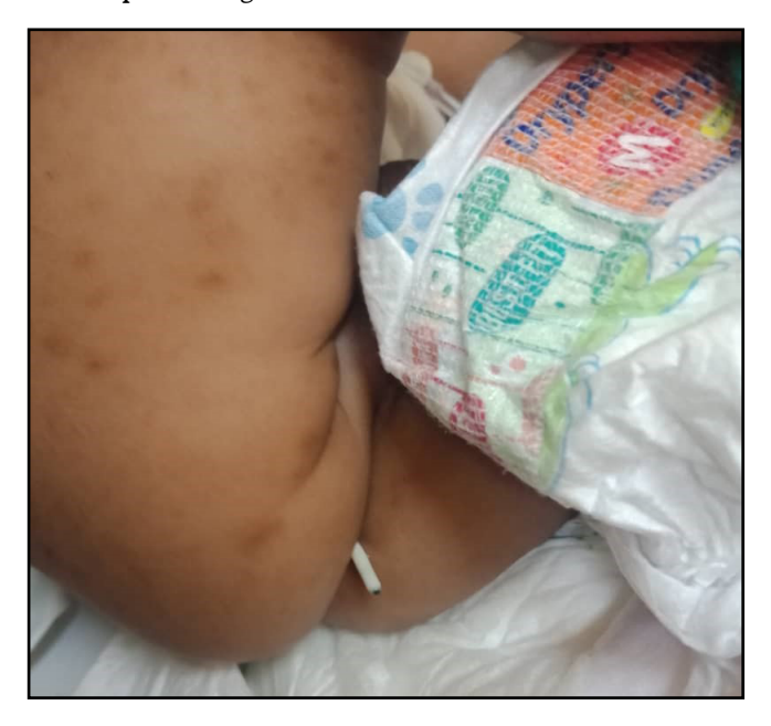
Figure 1. Transanal protrusion of distal tip of VP shunt.

Patient, 11-months-old male infant, initially presented with progressively increasing head circumference since birth, subsequently diagnosed with congenital communicating hydrocephalus. VPS placement was done at 6 months of life, distal tip inserted into peritoneal cavity and placed in pelvis via paraumbilical mini-laparotomy. Mother noted tip of VPS protruding from anus after 4 months of VPS inser-