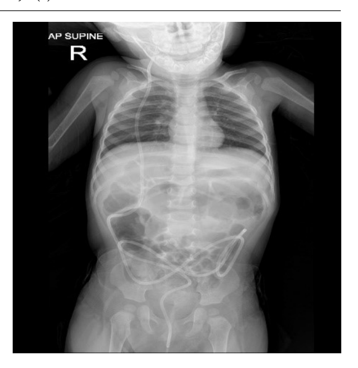
Figure 2. Abdominal X-ray showing the distal peritoneal catheter protruding through the rectum and anus.

tion, associated with clear CSF from anus, which required manual reduction each time after defecation (Figure 1). However, mother did not bring to seek medical treatment for that issue.