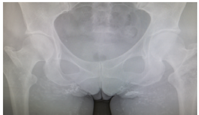
Figure 2. Numerous calcifications on radiological examination.

Laboratory tests revealed leukopenia 3.34 \times 10^9/L with neutropenia 1.41 \times 10^9/L , anemia (Hbg 11.9 g/dL) and a slightly increased amount of protein in 24 h urine collection (0.22 g / 24 h). The calcium metabolism was normal (parathyroid hormone 52.9 pg/mL, calcium 9.1 mg/dL, vitamin D3 level 57 ng/mL) and renal parameters were without significant deviations (serum creatinine 1 mg/dL, eGFR 58.9 mL/min/1.73 m 2 , serum urea concentration 32 mg/dL). A high level of ANA antinuclear antibodies was found in the titer 1 : 10000 and PmScl 100 was positive in the immunoblot. The radiological examination of the soft tissues around the buttocks showed numerous calcifications (Figure 2), and the histopathological examination of the subcutaneous nodule also showed the presence of calcifications (Figure 3). The diagnosis of dystrophic calcinosis most likely in the course of SLE was established. The treatment of the underlying disease was modified by adding hydroxychloroquine 200 mg daily, whereas calcium and vitamin D supplementation was discontinued. In the following months, the patient underwent litho-