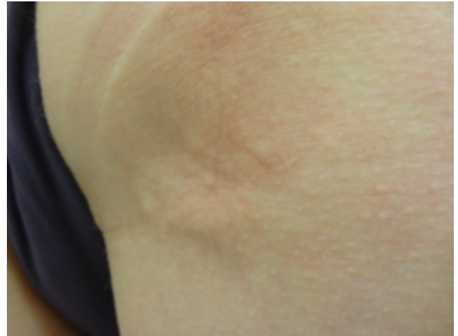
Figure 1. Subcutaneous nodules presented in buttocks area, skin surface unaffected.

A 49-year-old woman was admitted to the Department of Dermatology due to nodular lesions in the subcutaneous tissue in the buttocks area. The nodules were palpable for 2–3 years, were painless, but the patient reported noticeable discomfort while sitting on a hard surface (Figure 1). The patient was diagnosed with SLE 17-years ago. Leg ulcers, vasculitis and episodes of urticaria have occurred in the past. Previous laboratory tests revealed lower levels of complement components and high titers of antinuclear antibodies – ANA Hep2 1 : 2560 granular type with positive RNP Sm. She has been treated with hydroxychloroquine, periodically oral prednisone, intravenous methylprednisolone and recently with