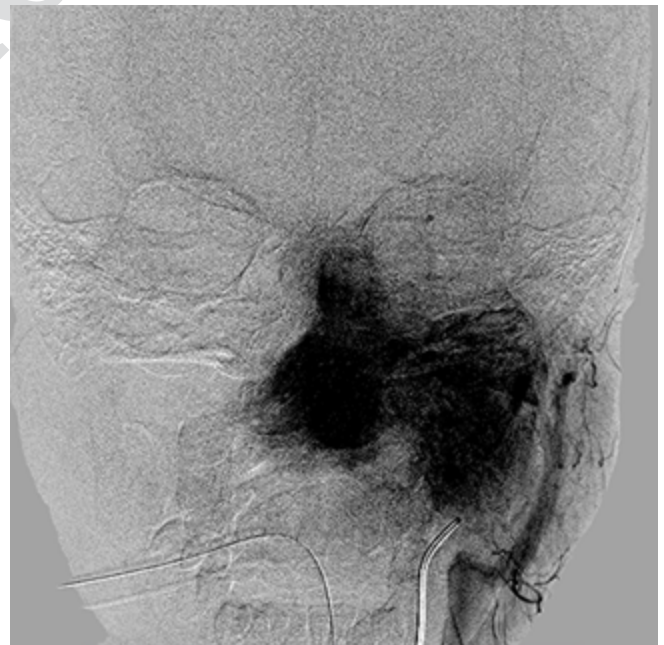
Figure 2. Angiography demonstrates the JNA is supplied by left maxillary artery.

Seven patients underwent angiography with selective embolization of maxillary artery and sphenopalatine artery 24 h prior to surgery with no complication. The average operation time was 137 minutes (range: 60–360 minutes). The intraoperative surgical blood loss varied from 500 mL to 1300 mL (mean 777.7 mL). Four patients required intraoperative blood transfusion. The duration of hospital stays range 2–5 days with an average of 3.5 days (Table 2). None of the patients had any vascular, ophthalmological or neurological complications. Postoperative nasal packing was done in all patients.